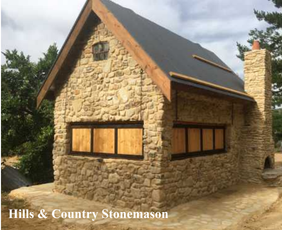
Hills & Country Stonemason