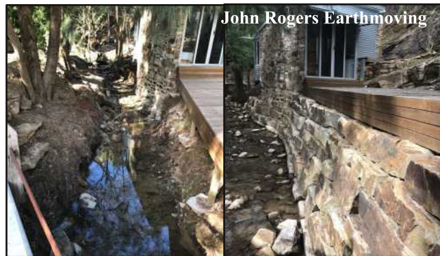
John Rogers Earthmoving

We hope these photos give you some inspiration for your next project