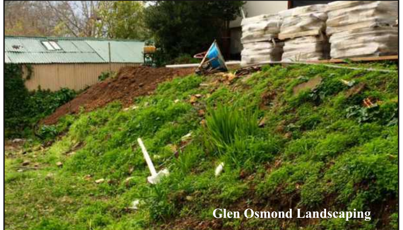
Glen Osmond Landscaping