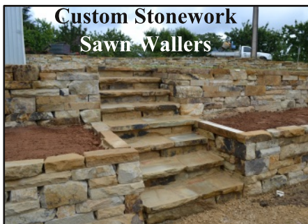
Custom Stonework Sawn Wallers