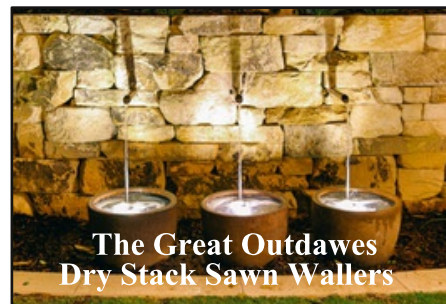
The Great Outdaves Dry Stack Sawn Wallers