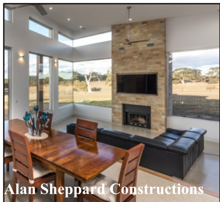
Alan Sheppard Constructions