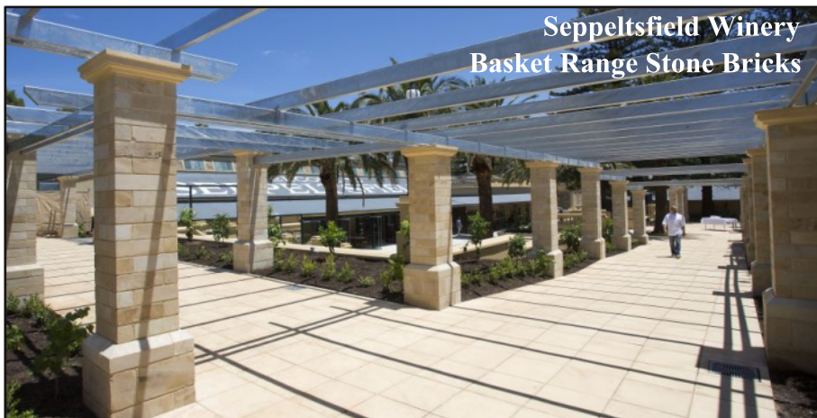
Seppeltsfield Winery Basket Range Stone Bricks

Please feel free to contact us with any questions or to get a quote.