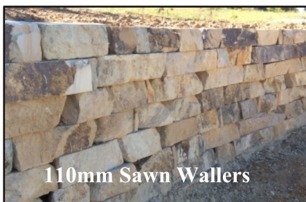
110mm Sawn Wallers