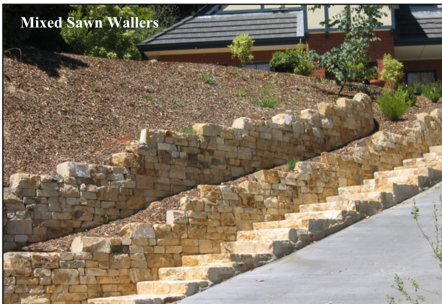
Mixed Sawn Wallers

If you would like more information, please don't hesitate to give us a call or drop in for a chat.