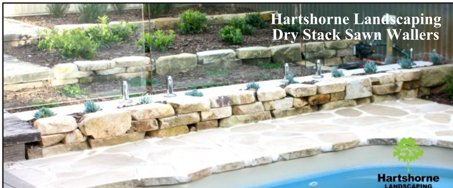
Hartshorne Landscaping Dry Stack Sawn Wallers