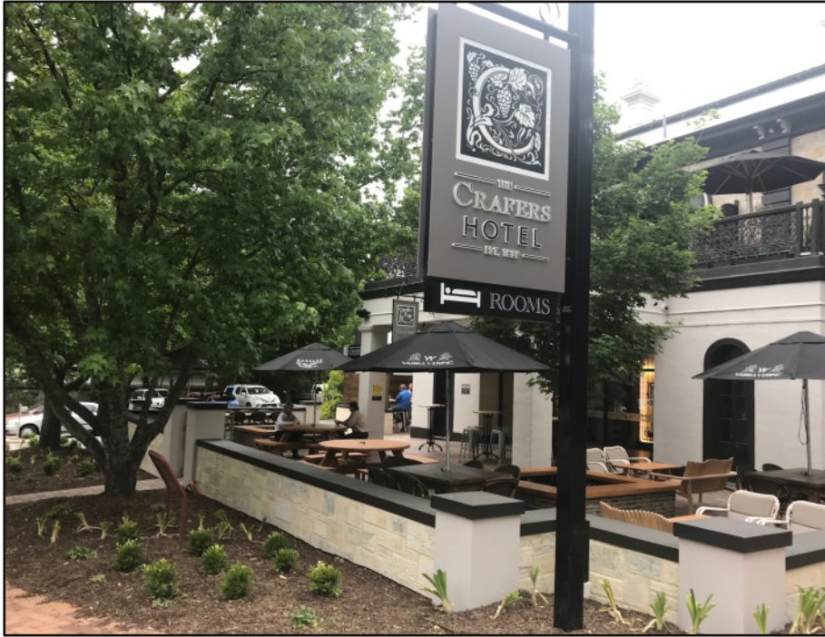
The Crafers Hotel stone is Hen Pecked / Bush Hammered Veneer