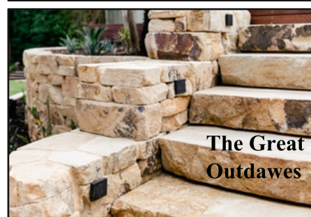
The Great Outdaves