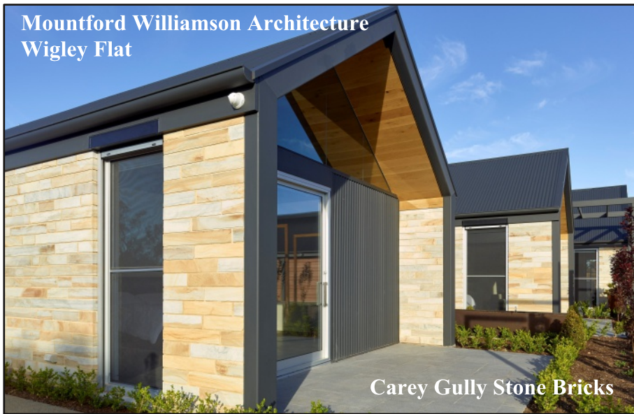
Mountford Williamson Architecture Wigley Flat