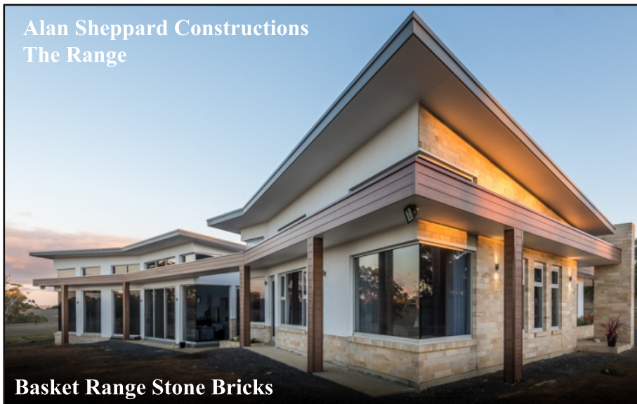
Alan Sheppard Constructions The Range