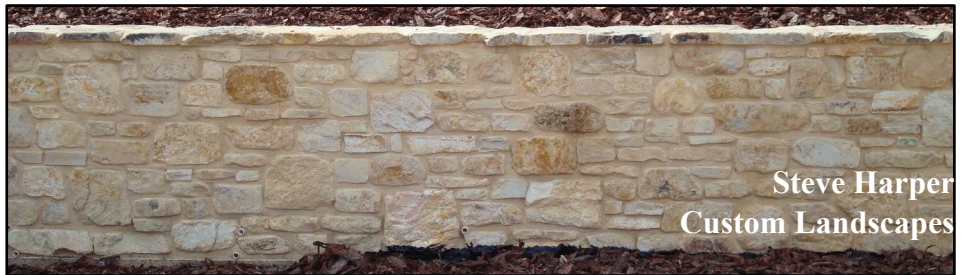
Steve Harper Custom Landscapes