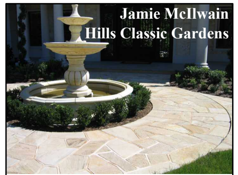
Jamie McIlwain Hills Classic Gardens