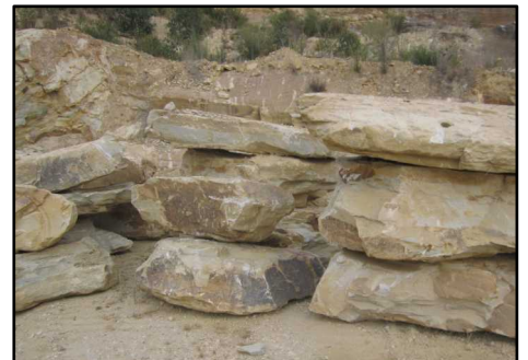
Pictured above: Carey Gully Quarry (top) Random Wallers (middle) Landscaping Boulders (bottom)