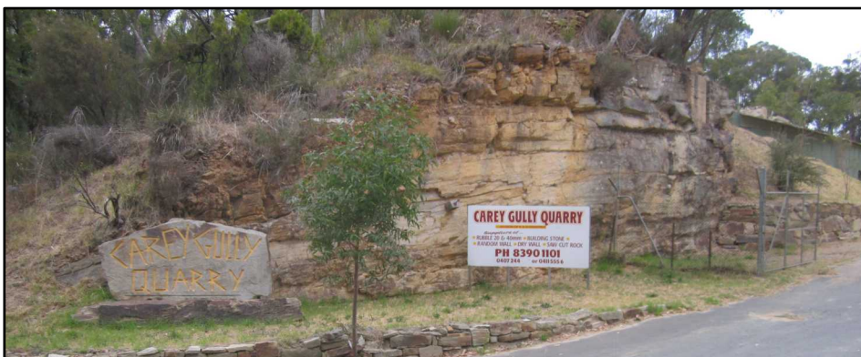
Pictured left: Carey Gully Quarry Entrance